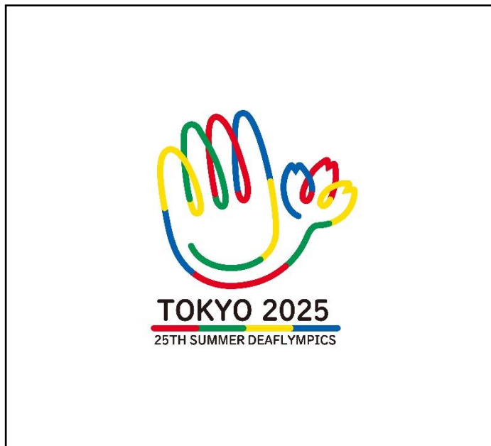
Example of a full-colour Emblem on a white background

Basically, the Emblem should be displayed in full colour on a white background. However, if it is displayed on a photo or coloured background, a boxed emblem or another appropriate manner should be used.