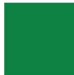
Green - PMS 355

Four-color process: Cyan 100% Magenta 0% Yellow 91% Black 6%