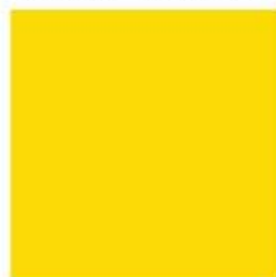
Yellow - PMS 108

Four-color process: Cyan 2% Magenta 11% Yellow 100% Black 0%