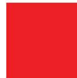
Red - PMS 485

Four-color process: Cyan 0% Magenta 100% Yellow 91% Black 0%