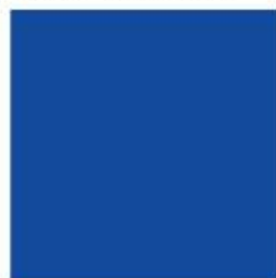
Blue - PMS 293

Four-color process: Cyan 100% Magenta 56% Yellow 0% Black 0%